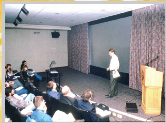
Oak Hammock Marsh Theatre

Audio-visual equipment is available for your meeting needs.